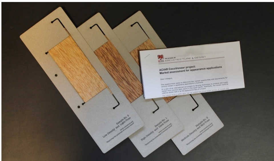
Figure 5: Coconut veneer samples as distributed.