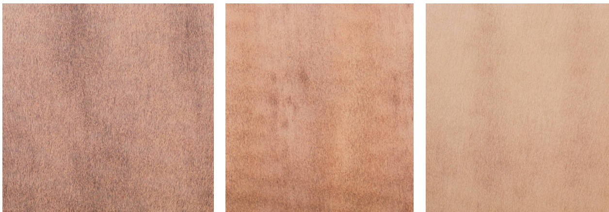
Figure 3: Varied visual character of coconut veneer.

Without normal wood features, peeled coconut veneer has generally consistent visually characteristics across the sheet, with distinct longitudinal grain and regular, generally coarse colour variation. This gives a mottled, lively texture to the surface. See Figure 3. While lively, the large piece size of veneer provides a much more consistent overall appearance than coconut wood board in applications such as flooring or wall lining.