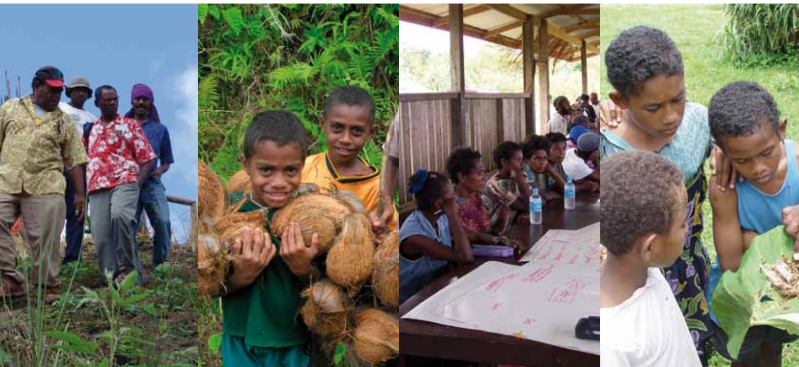
Exploring young people's relationship with farming.

to develop appropriate financial and business skills, be empowered to access land and credit and have control over the resulting financial returns from their activities. This reflects some of the objectives already adopted by MORDI, the Mainstreaming of Rural Development Innovations Programme. While a significant number of young people are involved in independent agricultural activities and providing agricultural support to their families, it was also noted that young people learn and benefit from communal agriculture, either through the local traditional systems or as members of youth groups. Such communal endeavours help the youth to build up self-esteem and a sense of community. The emphasis that young people place on the importance of their immediate support groups – family, community, church and school – highlights the need to improve the institutional “enabling environment” provided by these groups if young people are to develop as agricultural entrepreneurs.