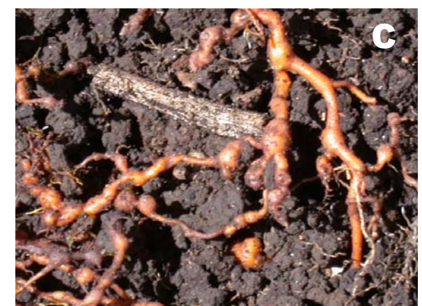
Figure 1: Root-knot nematode infections of A) pawpaw, B) parsley and C) noni.